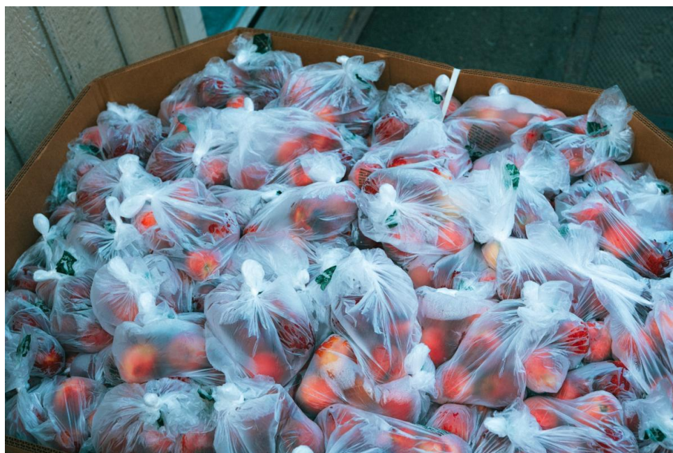
Delivery of apples and nectarines at Rider University.

On August 27th, MOWMC delivered the last batch of fresh produce!