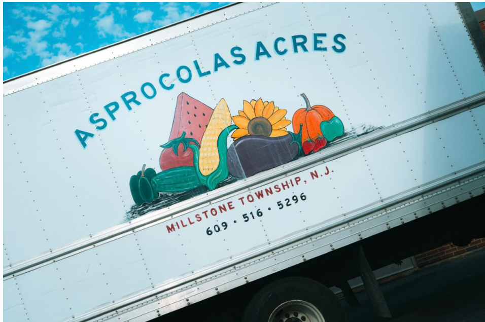
The Asprocolas Acres truck parked at Rider University.

This summer, thanks to Farmer George and Asprocolas Acres , a total of 5,360 bags of fresh fruits and vegetables were delivered to our participants!