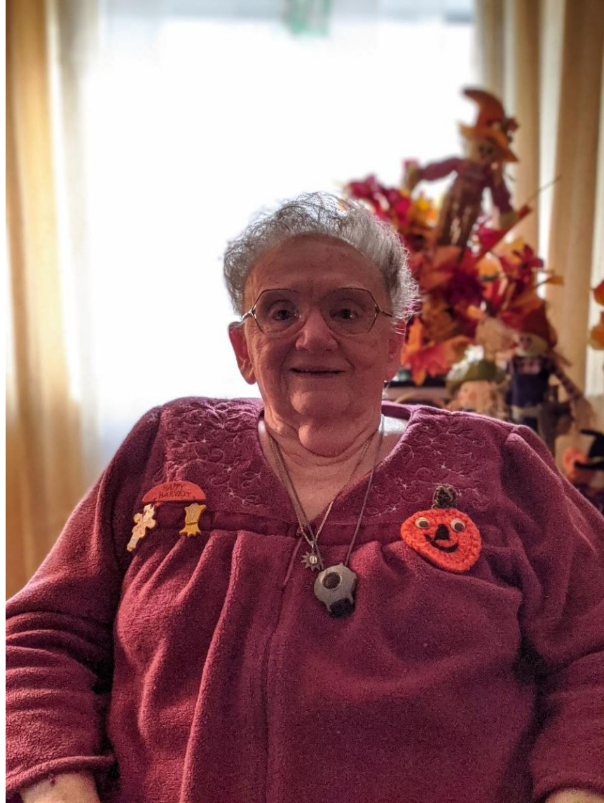
MOWMC participant in Ewing.