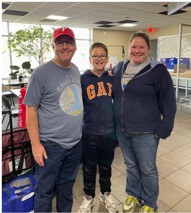
The Fine family at Rider University during meal delivery pickup.