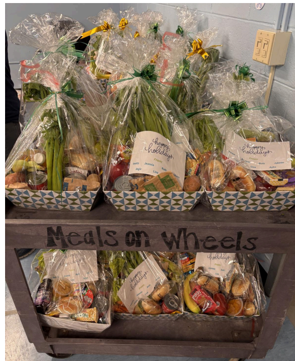
Preparation for holiday grocery deliveries.

MOWMC Staff packed 400 grocery bags and delivered them all in the span of two days the week before Christmas. It was a wonderful opportunity to bond as a team and connect with our participants on a personal level!