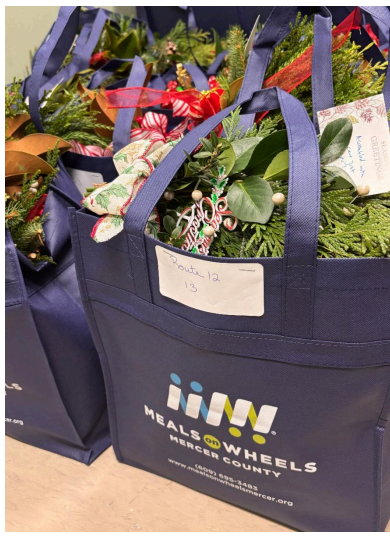
Holiday arrangements split into bags by route.