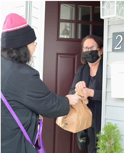
MOWMC participant greeting a volunteer.