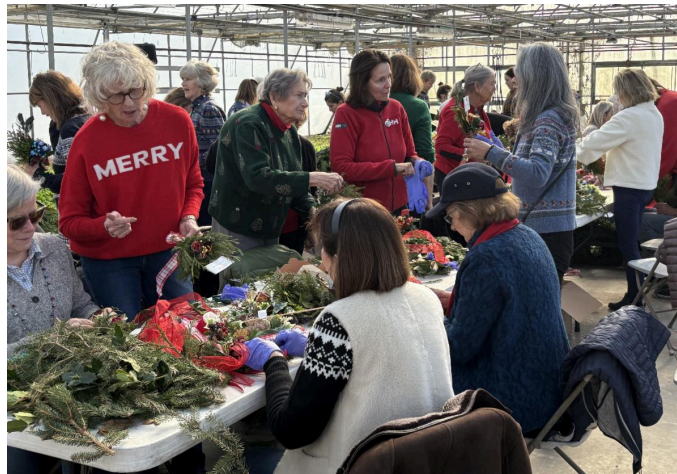
Holiday arrangements prepared by the Princeton Garden Club members.