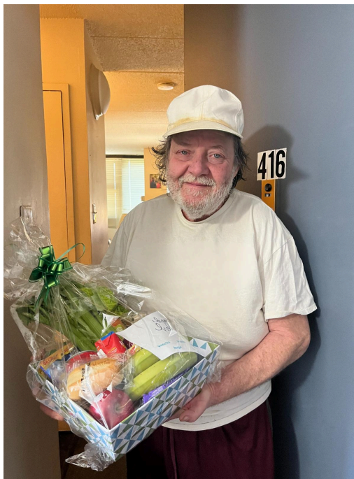
Participant with their grocery delivery.